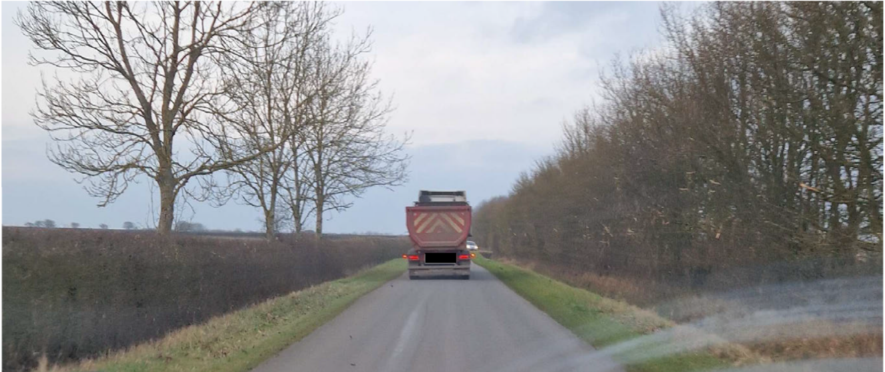
Figure 4 – Dash Cam capture indicating width of Moorhouse Road vs an Average HGV

This image was captured whilst travelling North to Hagg Lane and shows the white car utilising the field entrance on the right (that will become Site Access PA12) as a passing point Whilst the oncoming HGV accelerated up the hill towards Hagg Lane on the left.