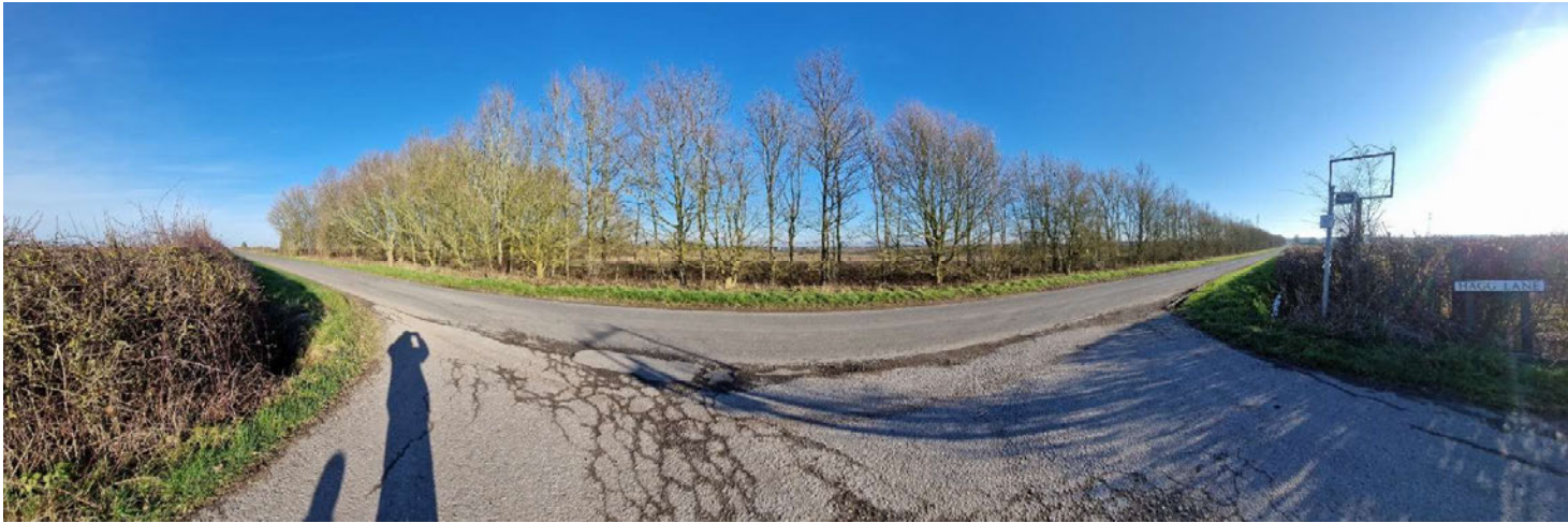
Figure 5 – Panoramic View of N1 as viewed through the existing screening trees (Taken 02/02/2025)

Note the sparsity of the foliage. Even during the summer, the foliage does not fully obscure the prospective solar array. A closer view is shown below.