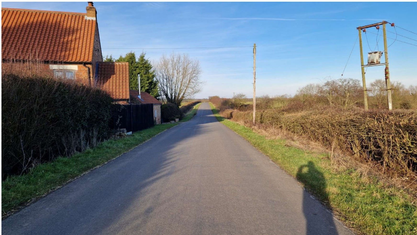
Figure 3 - Photo indicating the proximity of Partridge Lodge to Moorhouse Road